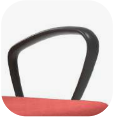
Fixed PU Handle