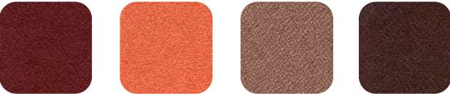
Red Orange Tan Brown