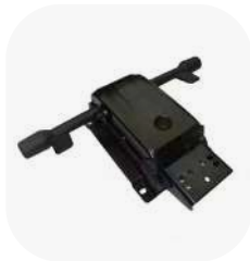
Auto weight sensing mechanism