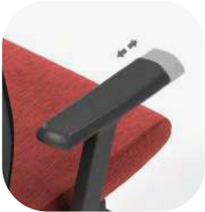
Depth Adjustable Armrest