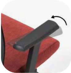
Angle Adjustable Armrest