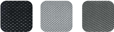
Black Grey Dark Grey