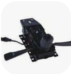
Synchro tilt with multilock & slider