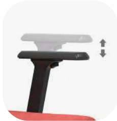
Height Adjustable Armrest