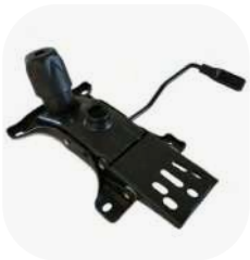
Synchro tilt with single lock