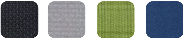
Black Grey Green Blue